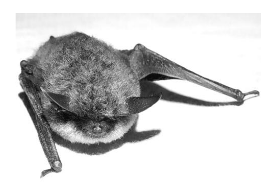
Little brown bats are common in Aurora. They weigh less than an ounce and have a wingspan of about 10 inches.